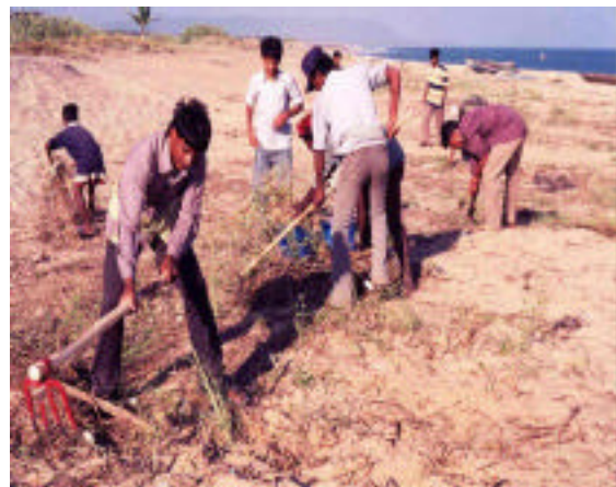
Figure 4: Beach cleaning programme was undertaken by the RAP at the Rushikulya Rookery