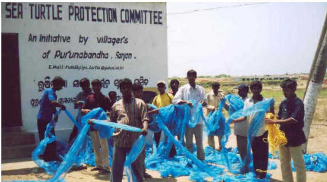
Figure 9: The permanent camp at Purunabandha village