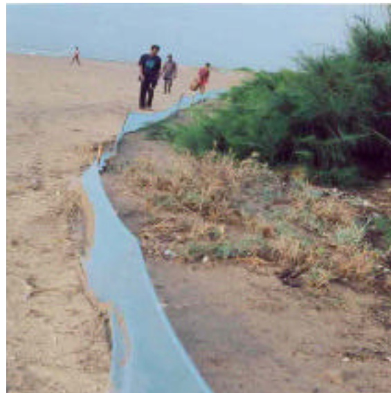
Figures 7 and 8: Plastic barrier nets were embedded to check the disorientation of hatchlings towards the source of light