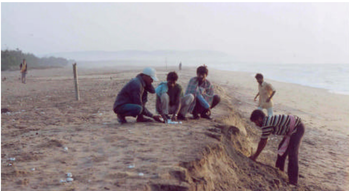
Figure 5: Those nests in danger of erosion and predation were transplanted immediately after nesting

As a precautionary measure to save the sporadic nests from non-human predation, local assistants were deployed on the beach from mid February. All necessary arrangements had been made to protect the nests from feral and other predators from mid February. The Investigator along with the RSTPC members and RAP local assistants also visited the