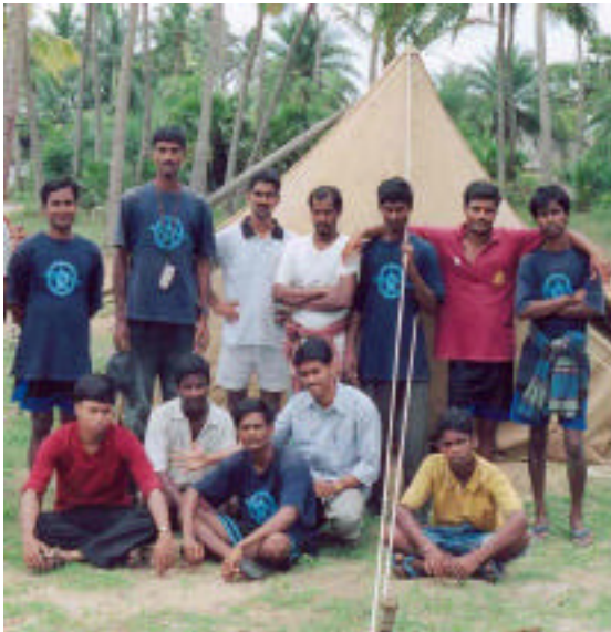
Figure 3: The Rapid Action Project (RAP) Team at Rushikulya Rookery