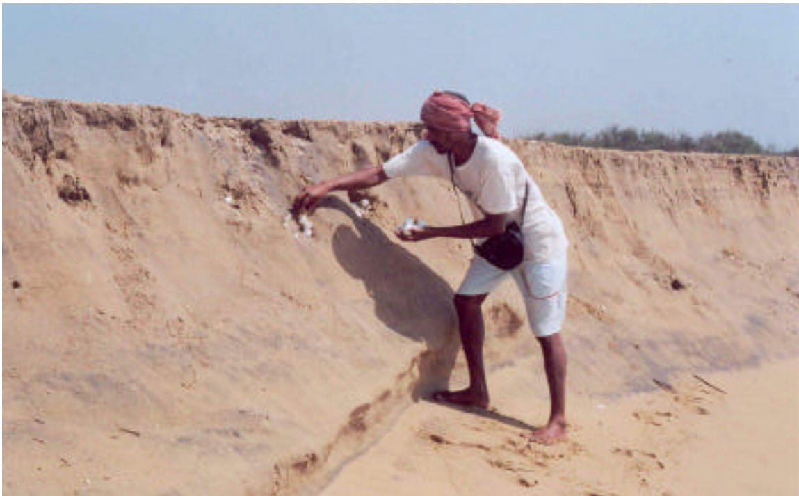
Figure 6: A RAP assistant collecting nest contents from the eroded beach

As a protection measure, the relocated nests were guarded by the RAP local assistants as well as by the RSTPC members for the entire incubation duration. Out of the total 234 relocated nests, from 189 nests, hatchlings emerged successfully (more than 90%) whereas 45 nests had