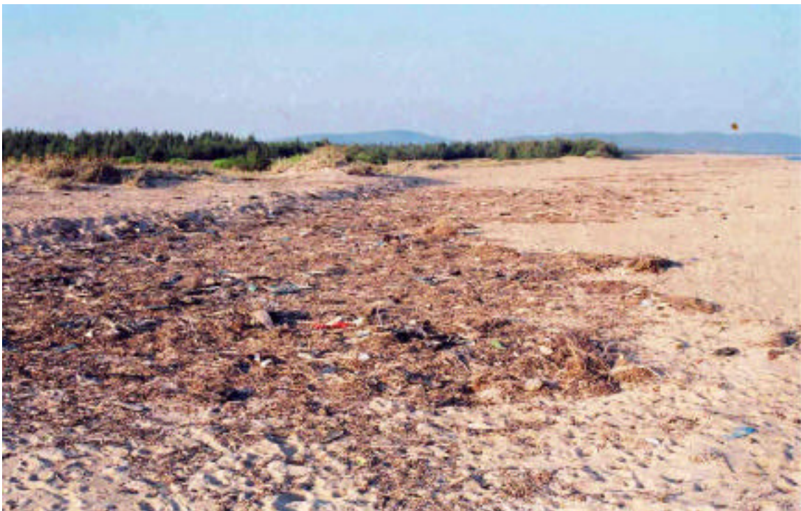
Figure 1: The 2003 Flood had deposited all kinds of waste on the beach at Rushikulya Rookery, Orissa

thus making the beach temporarily unsuitable for turtle nesting.(Figure 1) The protection of the nesting beach as well as sea turtle eggs and hatchlings are priority for saving the Olive Ridley population along the Orissa coast. Keeping this in mind, the Wildlife Trust of India's Rapid Action Project (RAP) was initiated with an effort towards protection of nests, eggs, and hatchlings and to the nesting habitat as a whole.